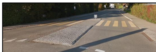
Crosswalk to PostBus Stop