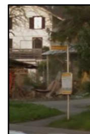
PostBus Stop ( Rüfenacht Schlössli )