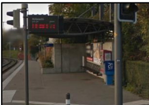
Rüfenacht Tram Stop

Post Bus Website https://www.postauto.ch/en Tram website http://www.bernmobil.ch